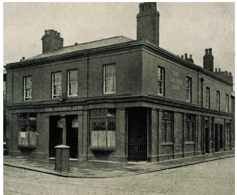
The Golden Lion In Carlisle before and after it was nationalised. On pubs operated by the government's Central Board of Control, external drinks advertising was banned

many of the licensing restrictions introduced by the Defence of the Realm Act, some of which we have only recently shaken off.